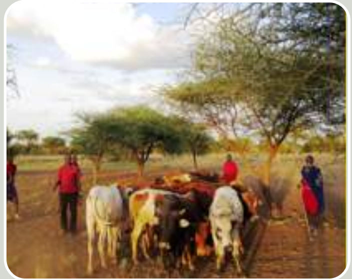
Group Cows ready to be fattened.

WILK’s microloan project is in its third year, with six livestock groups receiving loans. Joyce recently visited these groups to observe the condition of the cows purchased with the loans. Plentiful rains have led to large, healthy cows, which will be sold in July. Average group profits are expected to range between 30-40% once the loans are repaid.