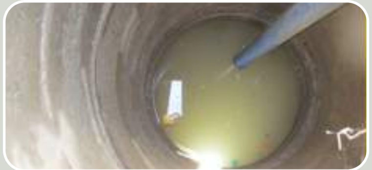
Looking down the shallow well used by villagers from Enkong'u Narok.

The situation in the village of Enkong'u Narok typifies the interconnected nature of water. Water is needed for the school, the dispensary, and the growing town. The town proposed a borehole and a hydrogeological survey identified a good site. The Enkong'u Narok Water Project Committee has collected the documentation to apply for the drilling permit. This committee has made great strides in accepting the responsibility of managing this project. Stay tuned, by July water may be flowing.